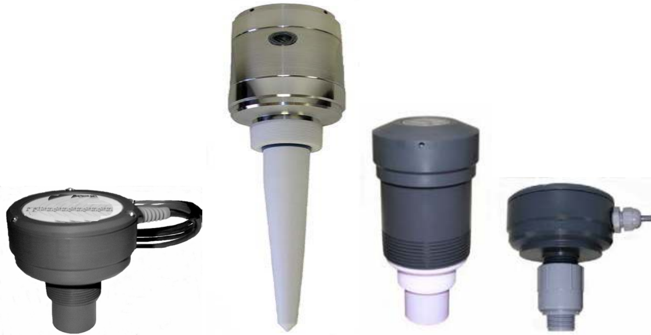
Ultrasonic Level transducers and Radar level transducers are available up to 100 feet