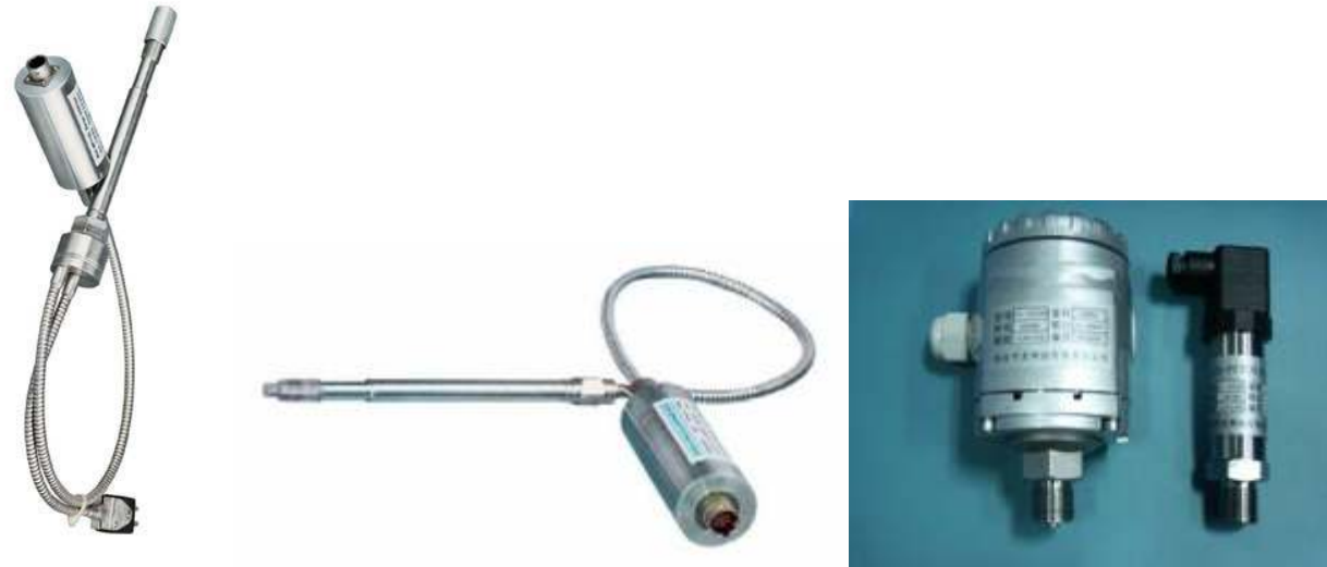
Pressure Transducers available from 0 to 12,000 PSI & Explosion Proof